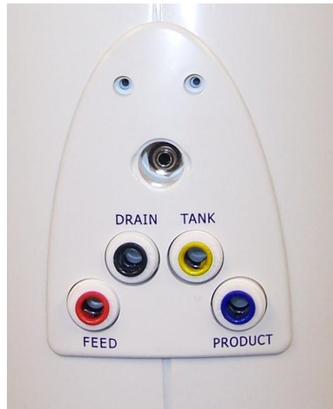
Figure 1: Connections for feed, drain, tank (for LINX 140T), and product water

If a system is to be disconnected for any reason, FIRST ensure that the feed water is turned off and the faucet is opened to depressurize it (open the faucet until water stops flowing). Then DISCONNECT THE POWER to the systems by detaching the power cord at the rear.