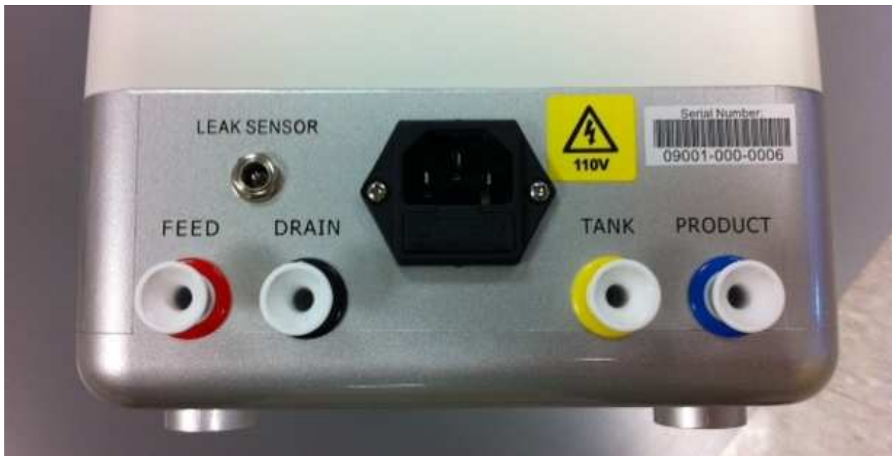
Figure 1: Connections for feed, drain, tank and product water

If a system is to be disconnected for any reason, FIRST ensure that the feed water is turned off, the valve to/from the tank is closed, and the faucet is opened to depressurize it (open the faucet until water stops flowing). Then DISCONNECT THE POWER to the systems by detaching the power cord at the rear.